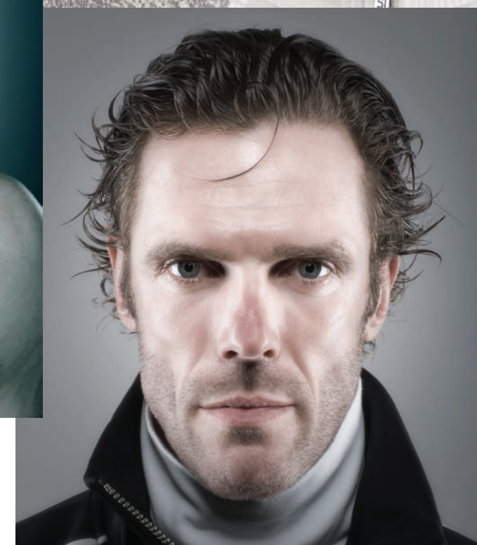
Mario Cipollini Solvang, California Feb. '07