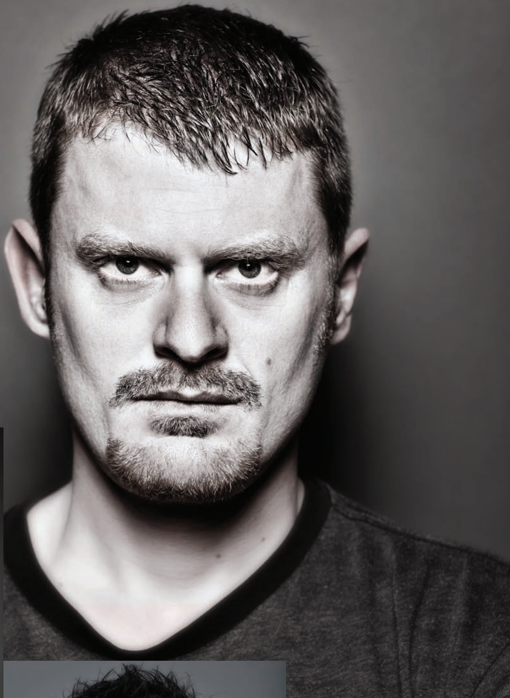
Floyd Landis San Diego, California Jan. '09