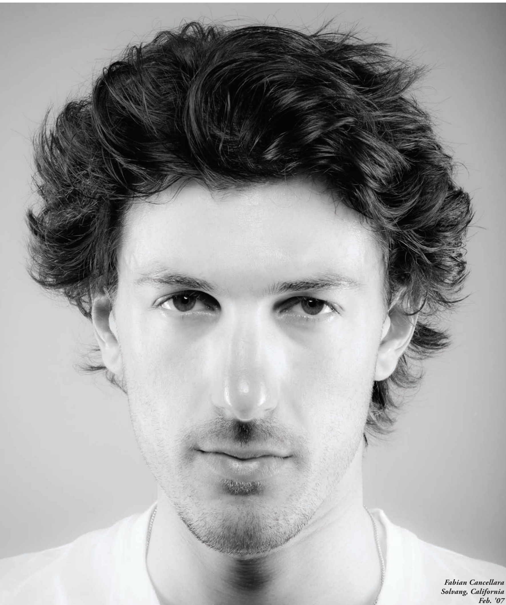
Fabian Cancellara Solvang, California Feb. '07

ROAD Magazine's oversized format, heavy paper and generous features well have always appealed to me as a photographer. I first noticed it about 10 years ago and was soon doing portraits for ROAD on a regular basis.