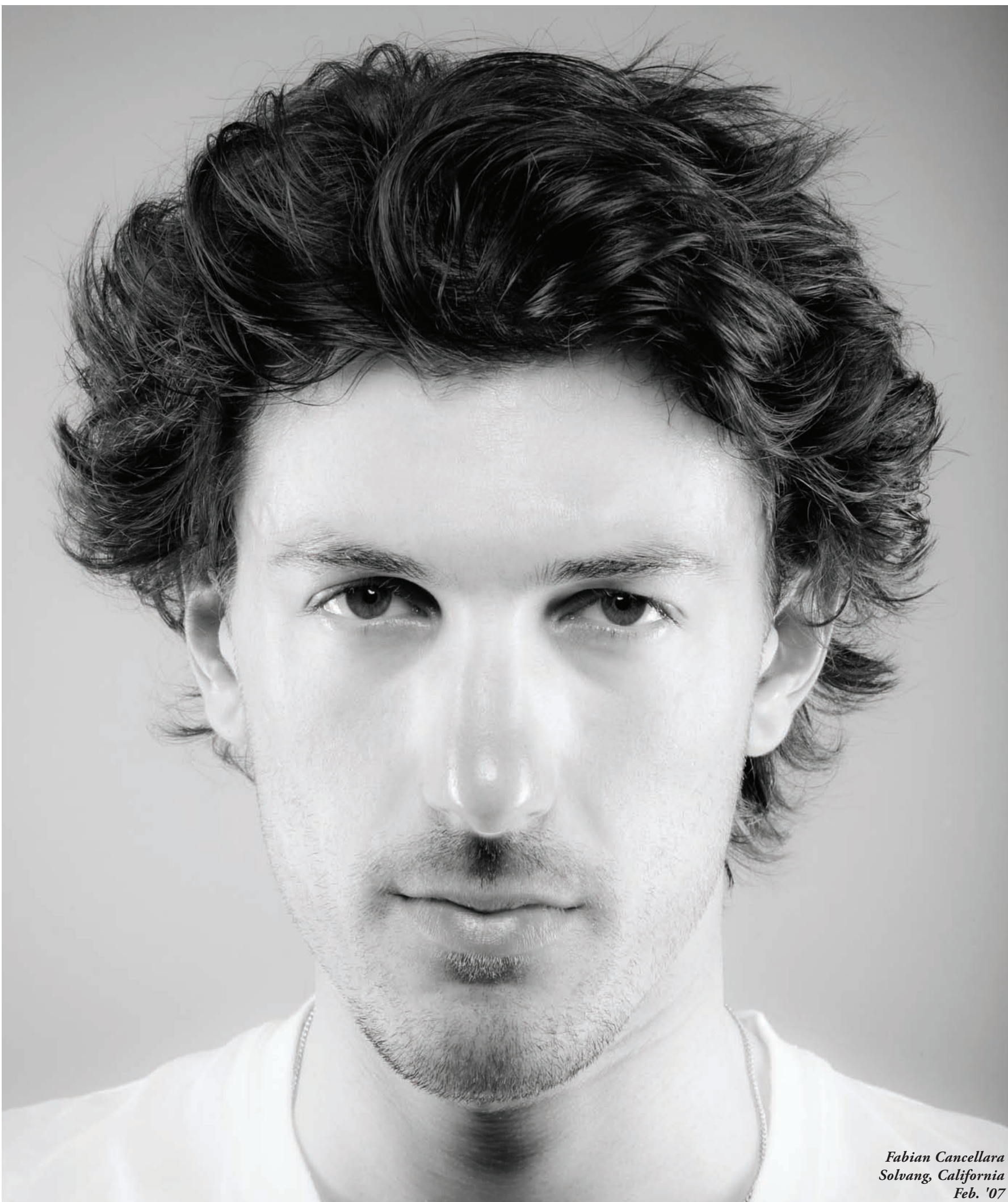
Fabian Cancellara Solvang, California Feb. '07

ROAD Magazine's oversized format, heavy paper and generous features well have always appealed to me as a photographer. I first noticed it about 10 years ago and was soon doing portraits for ROAD on a regular basis.