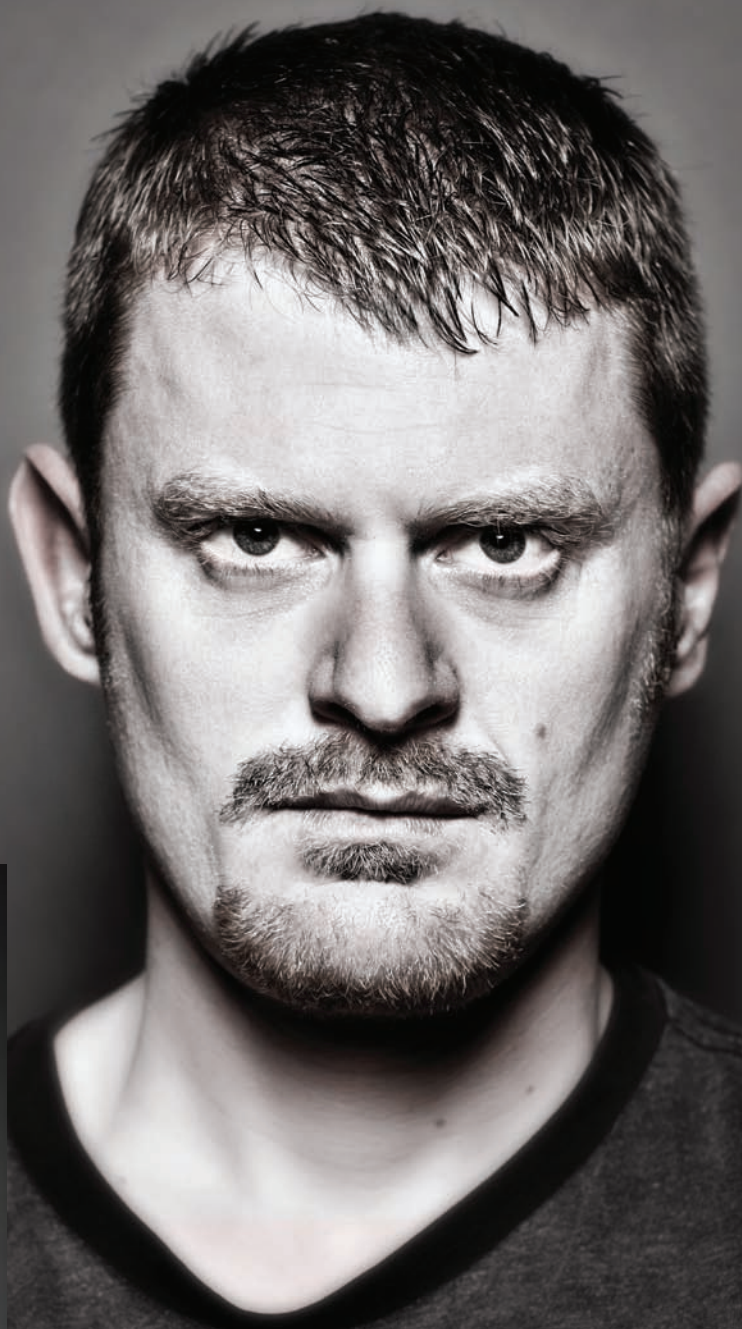
Floyd Landis San Diego, California Jan. '09