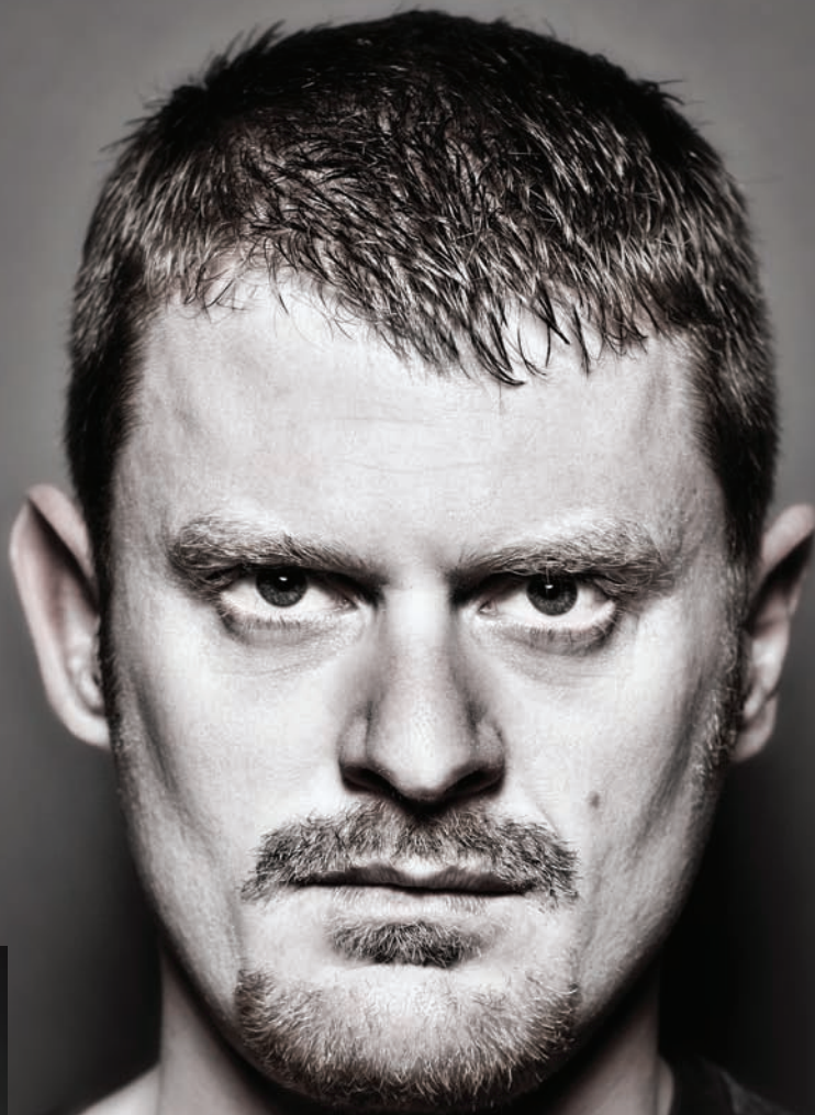
Floyd Landis San Diego, California Jan. '09